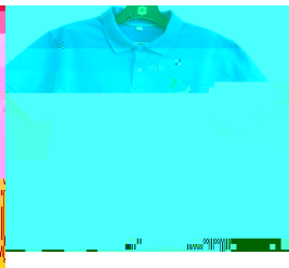
Short sleeve polo