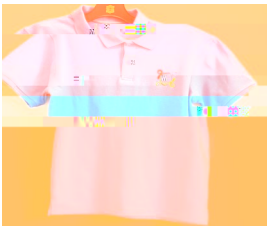
Short sleeve polo