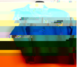
Long sleeve polo